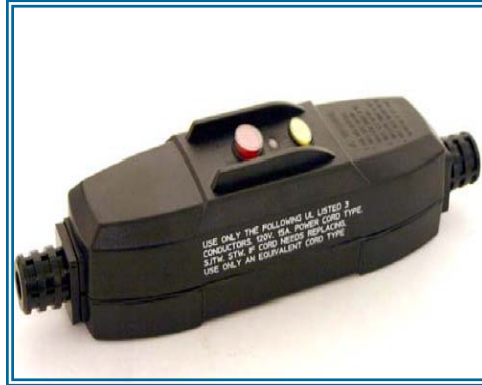
GFCI (Ground Fault Circuit Interrupter)

ALCI / AFCI / LCDI Power Cord Assembly also available